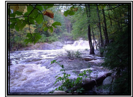
Isinglass River, Barrington, NH

The Isinglass Award promotes teen reading by inviting teens to help select great literature. Each year, 7 th and 8 th graders across NH nominate their favorite books and vote on the top 10 in April.